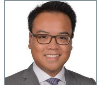
TIEN TAI Shipping Partner HFW Transactional legal advisor specialising in shipping asset finance.